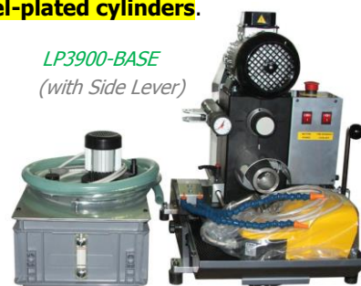
LP3900-BASE (with Side Lever)