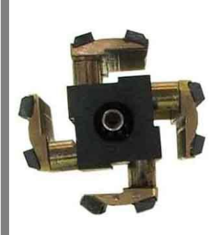
Stone set type E1