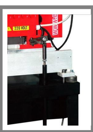
All right reserved. Technical characteristics and dimensions can be modified without notice